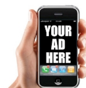
Mobile Ad Firm Ringleader Digital Spins Off Ad Network