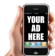
Mobile Ad Network JumpTap Goes After Google (GOOG)